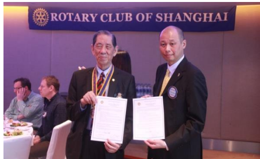
Exchanging Sister Club Certificates with the RC Hongkong Island West

The meeting was adjourned with a toast to the RC Hongkong Island West.